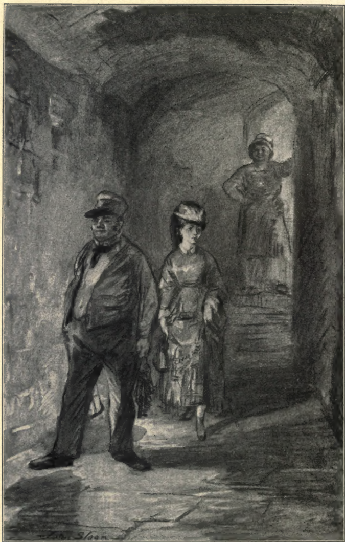
DIONYSIA, FOLLOWING THE JAILER ALONG INTERMINABLE PASSAGES, THROUGH A VAST VAULTED HALL